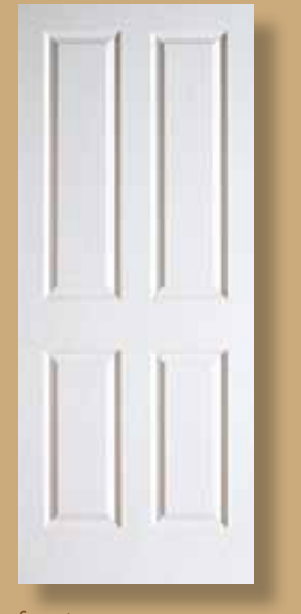
Coventry Textured — Passage / Bifo