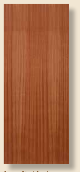
Quarter Sliced Sapele