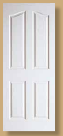
Carmelle Textured – Passaae / I