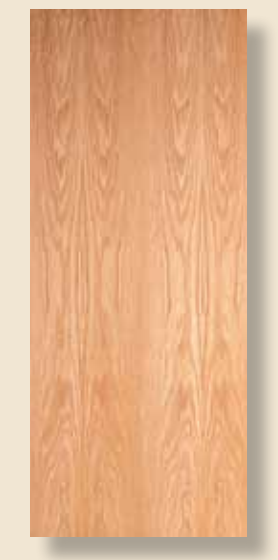
Plain Sliced Red Oak