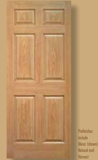
Colonist Prefinished Textured – Passage / Bifold

Lynden Door's Molded doors are available with hollow or solid core construction and matching bifolds. (Please consult the fold-out Sizing Chart.) 1-3/8" and 1-3/4" thick. All Lynden Door molded panels are factory primed, pre-graded and acclimated before fabrication to produce top quality, stable surfaces. Molded door panels offer an ideal substrate for finish painting. Contact your Lynden Door representative for information on fire rated molded panel doors.