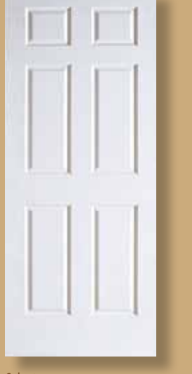
olonist extured – Passage / Bifold